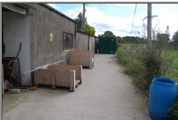
Rear External Storage Area East