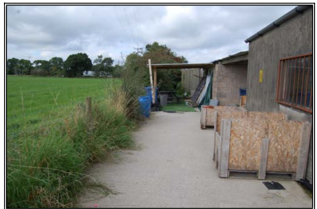
Rear External Storage Area West