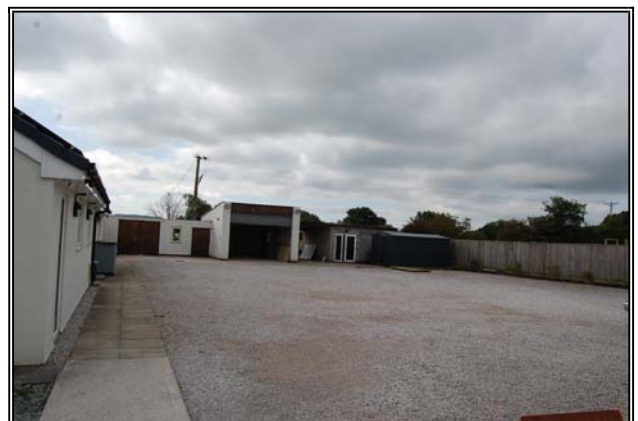
Yard and Car Park